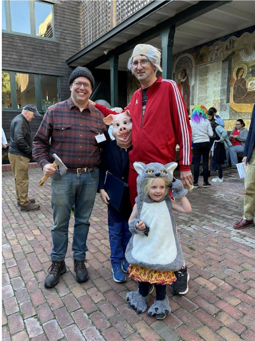
Photo from last year's Spooky Sunday Sunday, October 29, 2023

Newcomers and visitors, we welcome you warmly. May you find here, by the grace of God, that which feeds your soul. May you leave here with a heart prepared to serve.