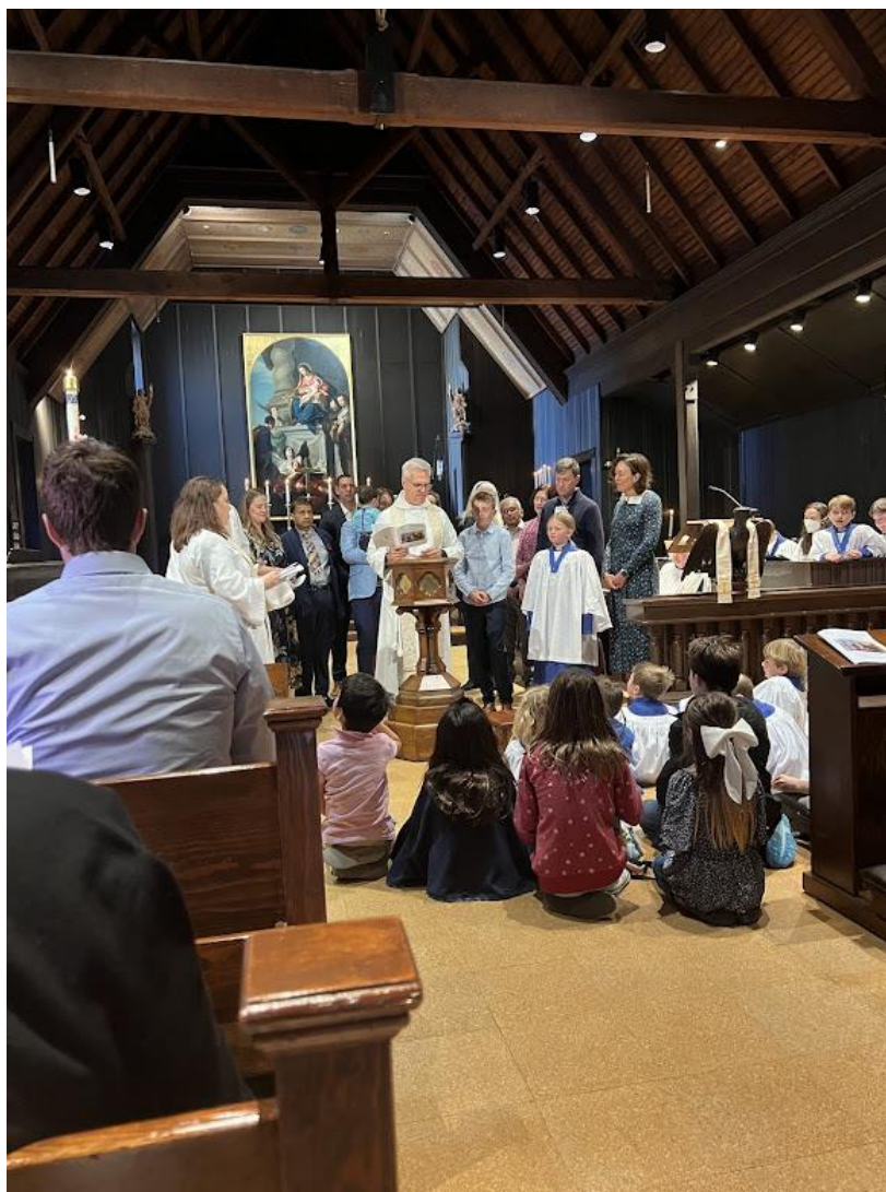
Photo of last Sunday's baptisms Sunday, November 3, 2024

Newcomers and visitors, we welcome you warmly. May you find here, by the grace of God, that which feeds your soul. May you leave here with a heart prepared to serve.