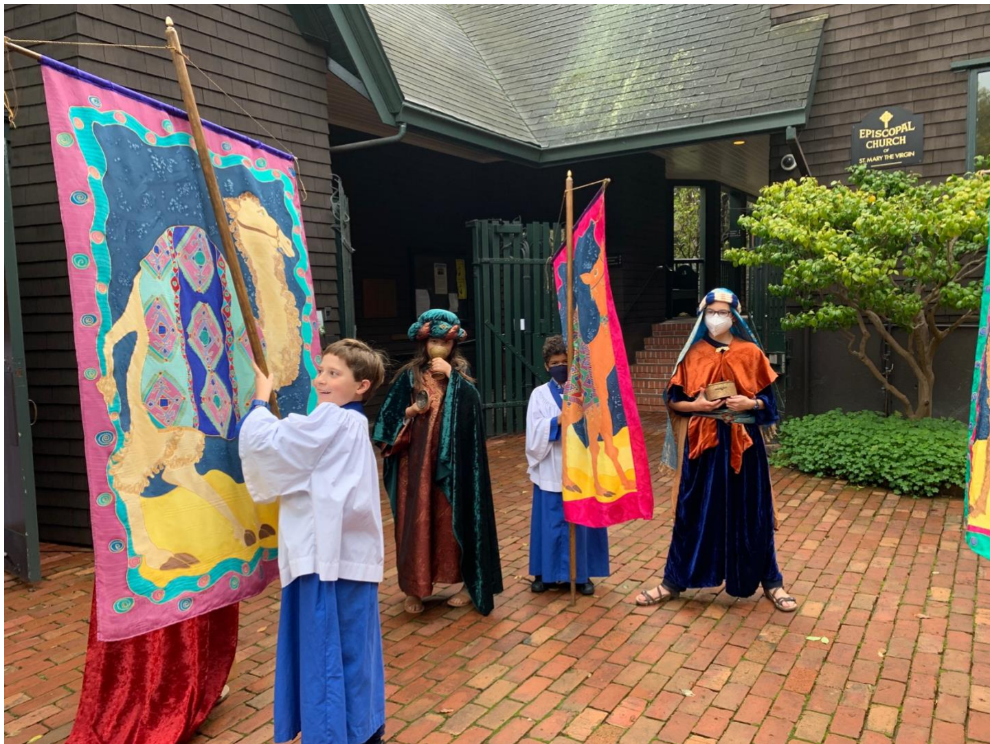
Photo from The Procession of the Magi on January 8, 2023.

Newcomers and visitors, we welcome you warmly. May you find here, by the grace of God, that which feeds your soul. May you leave here with a heart prepared to serve.