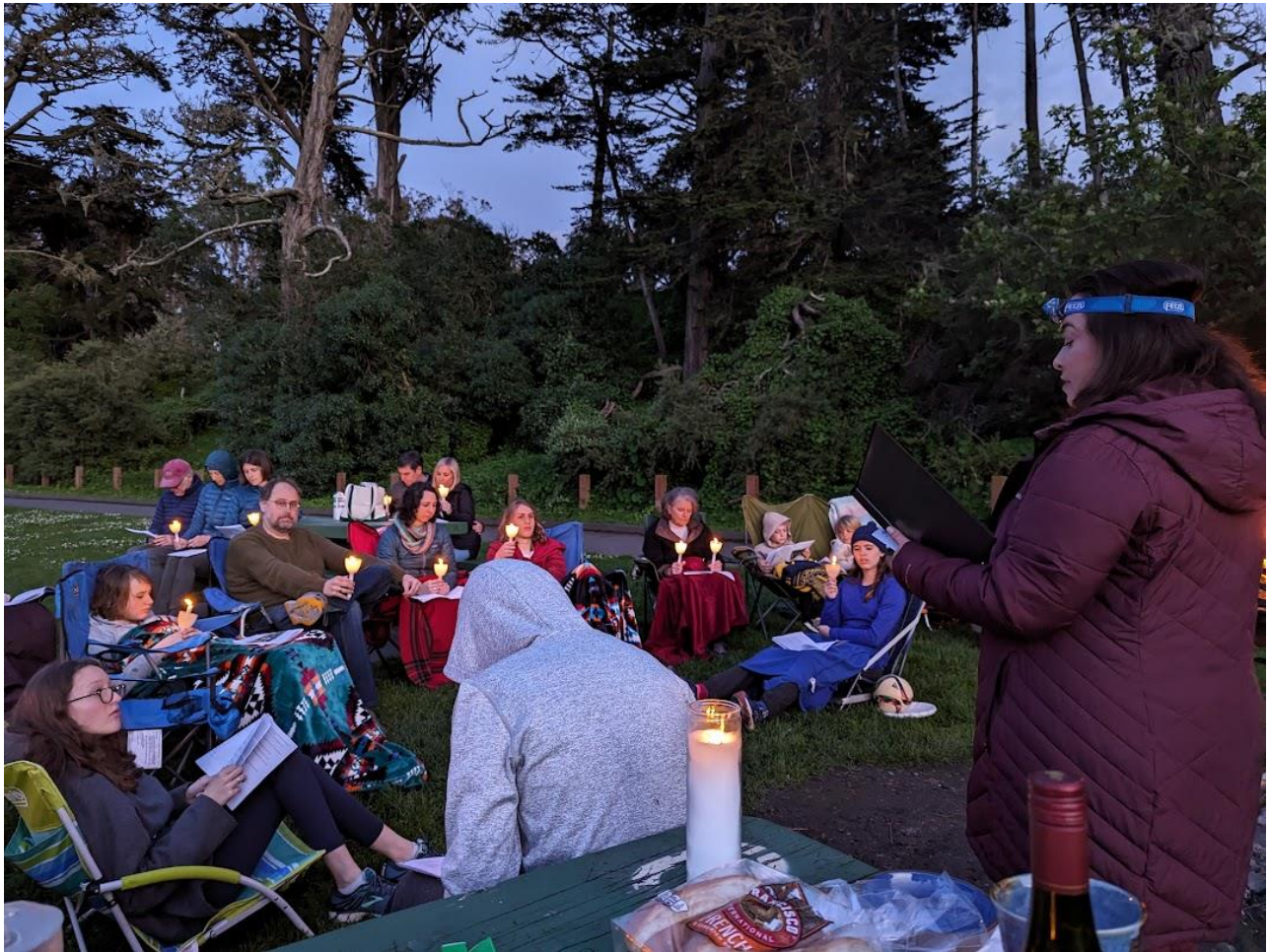
Photo from Easter Vigil Service on Saturday, March 30, 2024.

Newcomers and visitors, we welcome you warmly. May you find here, by the grace of God, that which feeds your soul. May you leave here with a heart prepared to serve.