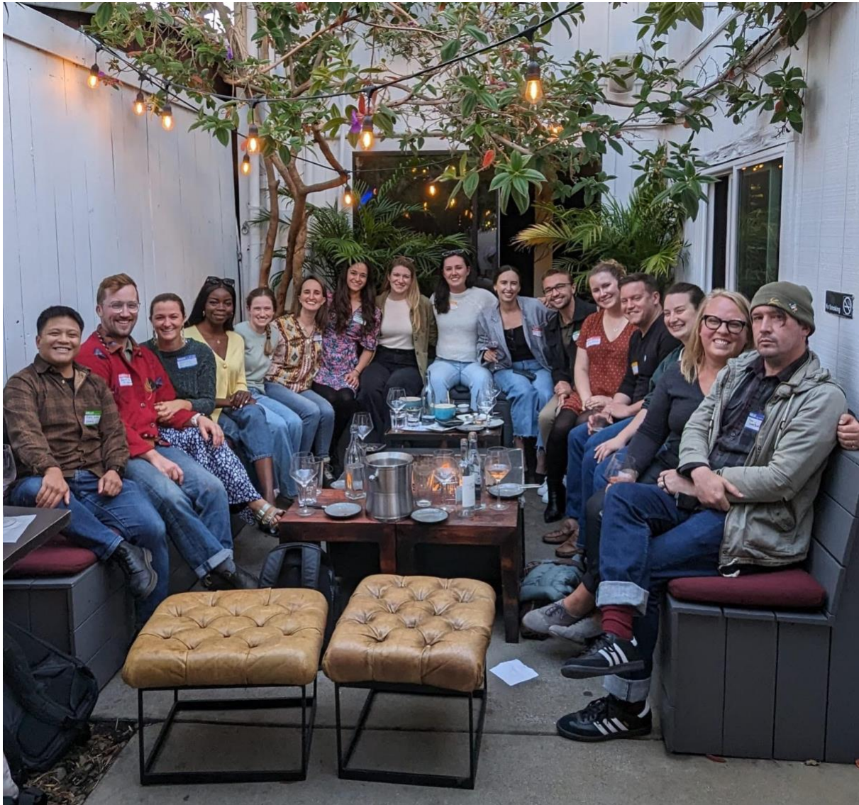
Photo from the St. Mary's Young Professional Happy Hour with Young Professional members from St. John's in the Mission, St. Aidan's & St. Cyprian's Wednesday, May 29, 2024.

Newcomers and visitors, we welcome you warmly. May you find here, by the grace of God, that which feeds your soul. May you leave here with a heart prepared to serve.