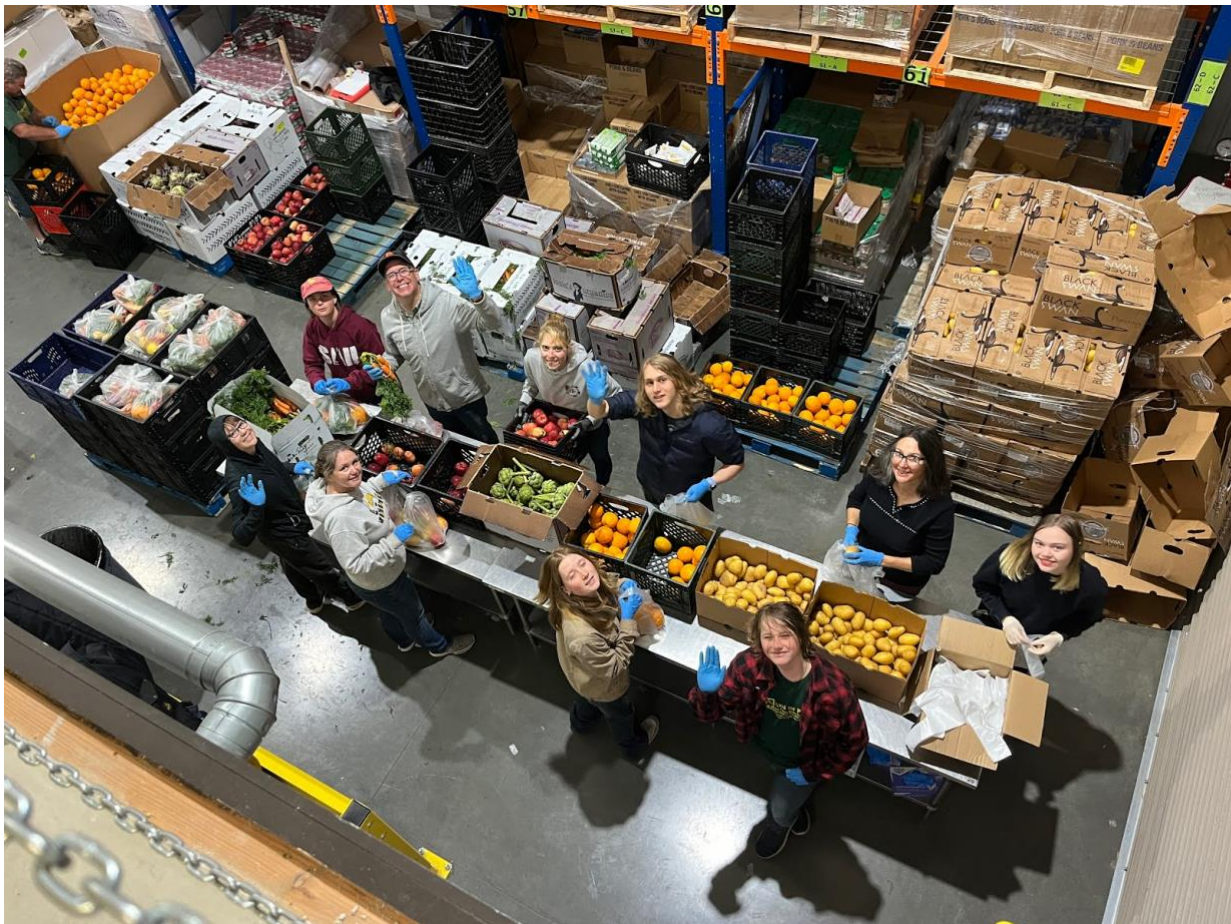
Photo from the St. Mary's Mission Trip to Eureka, California. Pictured is the crew bagging produce at "Food for People".

Newcomers and visitors, we welcome you warmly. May you find here, by the grace of God, that which feeds your soul. May you leave here with a heart prepared to serve.