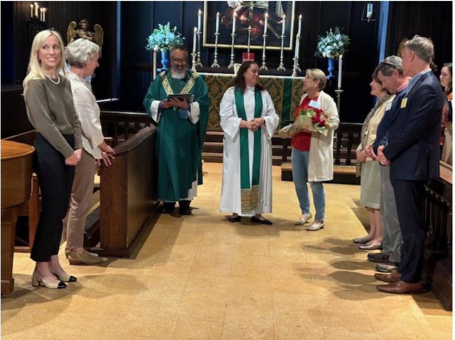
Photo from the commemoration of the 50th anniversary of women's ordination On Sunday, July 21, 2024.

Newcomers and visitors, we welcome you warmly. May you find here, by the grace of God, that which feeds your soul. May you leave here with a heart prepared to serve.